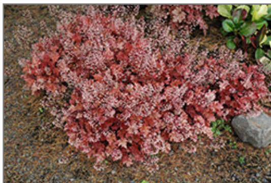
Peach Crisp Coral Bells in bloom

Peach Crisp Coral Bells is recommended for the following landscape applications;