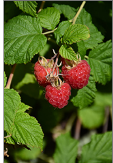
Raspberry Shortcake Raspberry fruit

Raspberry Shortcake Raspberry has rich green deciduous foliage on a plant with an upright spreading habit of growth. The textured oval compound leaves do not develop any appreciable fall color. It features an abundance of magnificent red berries in mid summer.