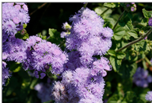
Blue Horizon Flossflower flowers

Blue Horizon Flossflower is recommended for the following landscape applications;