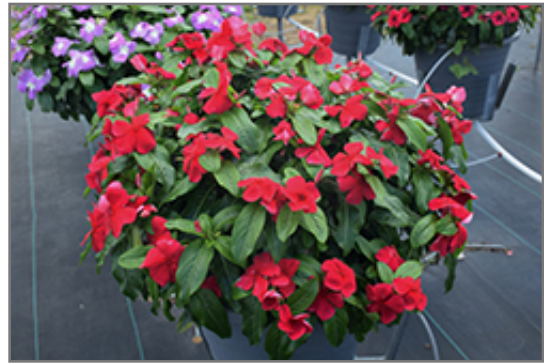
Titan Dark Red Vinca in bloom

Titan Dark Red Vinca will grow to be about 14 inches tall at maturity, with a spread of 12 inches. Its foliage tends to remain dense right to the ground, not requiring facer plants in front. Although it's not a true annual, this fast-growing plant can be expected to behave as an annual in our climate if left outdoors over the winter, usually needing replacement the following year. As such, gardeners should take into consideration that it will perform differently than it would in its native habitat.