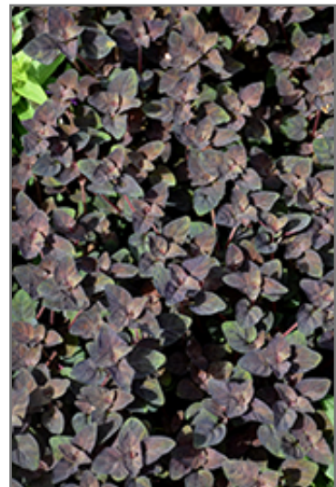
Persian Chocolate Loosestrife foliage