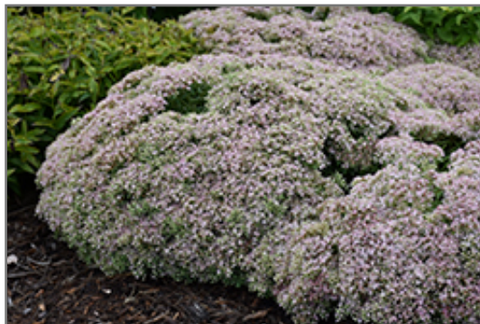
Rock 'N Round Pure Joy Stonecrop in bloom

This is a relatively low maintenance plant, and is best cleaned up in early spring before it resumes active growth for the season. It is a good choice for attracting bees and butterflies to your yard, but is not particularly attractive to deer who tend to leave it alone in favor of tastier treats. It has no significant negative characteristics.