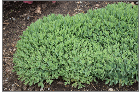
Rock 'N Round Pure Joy Stonecrop

Rock 'N Round Pure Joy Stonecrop is a fine choice for the garden, but it is also a good selection for planting in outdoor pots and containers. It is often used as a 'filler' in the 'spiller-thriller-filler' container combination, providing a mass of flowers and foliage against which the thriller plants stand out. Note that when growing plants in outdoor containers and baskets, they may require more frequent waterings than they would in the yard or garden.