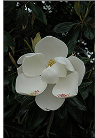
Teddy Bear Magnolia flowers