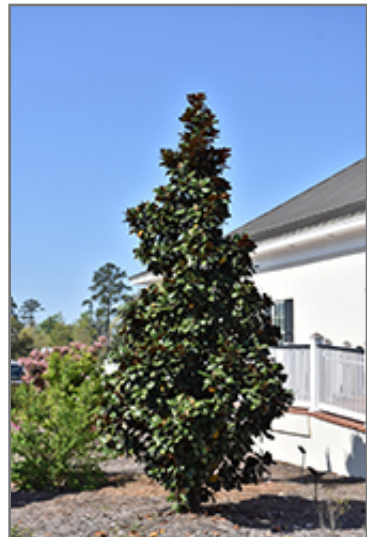
Teddy Bear Magnolia