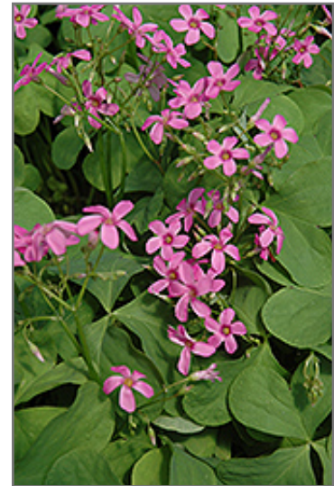
Pink Wood Sorrel flowers